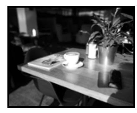
Milk & Sugar cafe and bistro, 1 Central Square